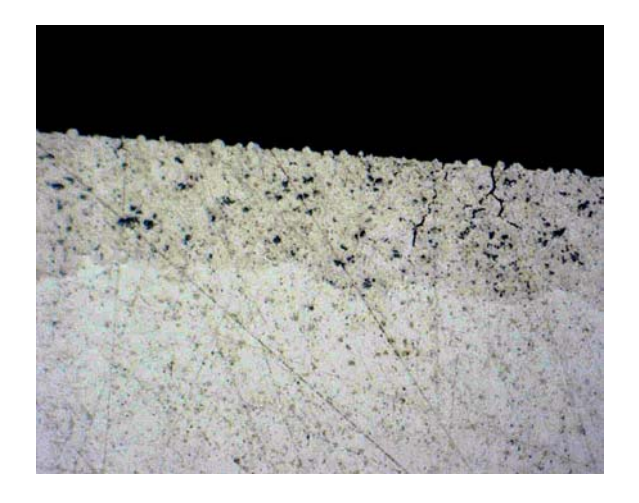
Figure 2e Plata Brillante