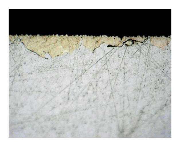
Figure 2c Lustre Silver