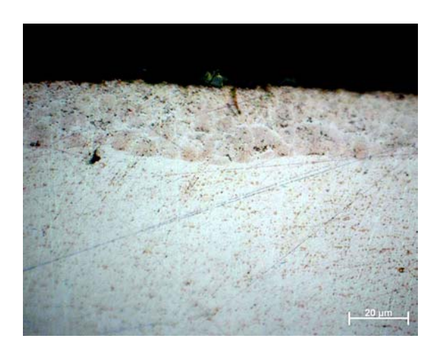
Figure 2a Standard Sterling