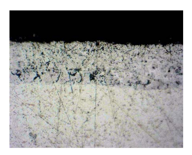
Figure 2d Low Tarnish Low Fire Silver